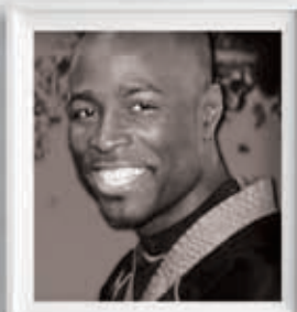
JADI TENTION USA Men's Grand Champion 2012