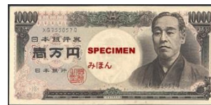
10000 Yen ( Old )