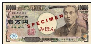
10000 Yen ( New )