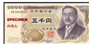
5000 Yen ( Old )