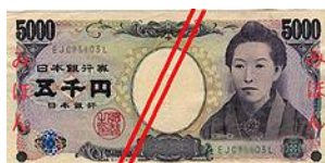
5000 Yen ( New )