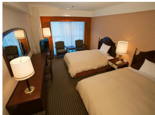
Rose Hotel Yokohama