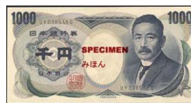
1000 Yen ( Old )