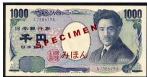
1000 Yen ( New )