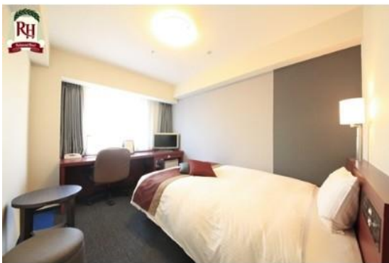
Richmond Hotel Yokohama Basha-michi